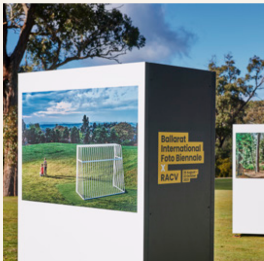
The Goldfields Resort 2023 Biennale exhibition was popular.

● Yellow Dot Fundraiser: Ballarat International Foto Biennale, 24 October 2024, 6.30pm, Pavilion, Level 2, City Club, $200 with Yellow Dot artwork to take home, or $50 attendance with refreshments. Book via this link or scan the QR code.