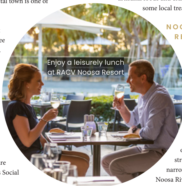
Enjoy a leisurely lunch at RACV Noosa Resort

From the ocean shoreline to the Noosa Everglades, Noosa River is a natural playground. Noosa Everglades - one of only two everglades in the world - is a 60km stretch of magnificent flora and fauna and narrow waterways found in the upper reaches of Noosa River.