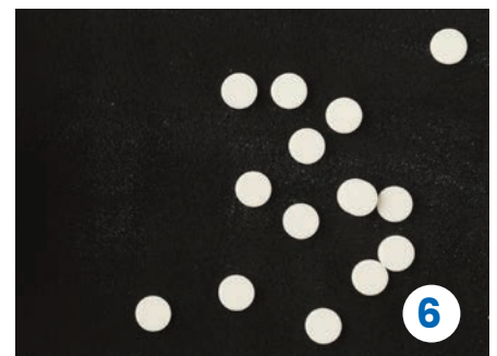
6. Ecstasy (MDMA) – illegal