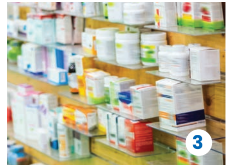
3. Over the counter medications