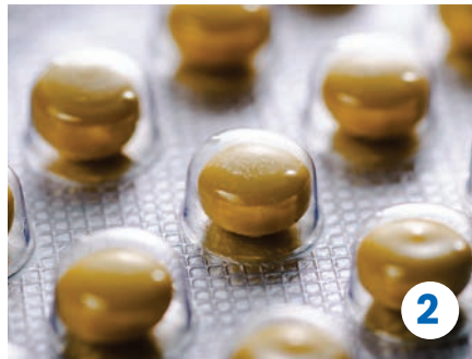
2. Prescription medications