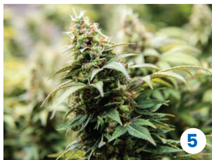
5. Cannabis (marijuana) – illegal