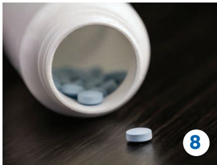
8. Misuse of prescription drugs