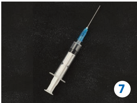
7. Heroin – illegal